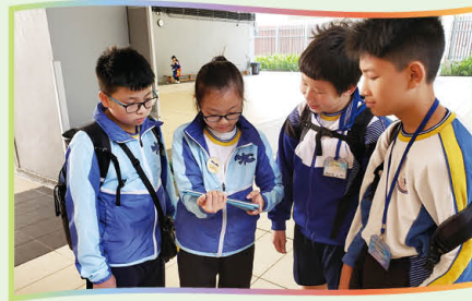
iPads help get students talking