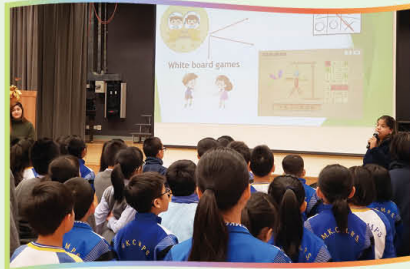
Introduction assembly for Chat Captains