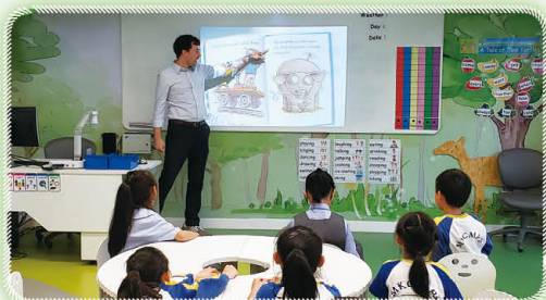
Students listening to a story about Fly Guy