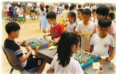
Playing fun games

Fun and Food Festival is a great reward every year for students who go above-and-beyond in English participation and performance. There are photo booths, dim sum, snacks, face painting and games. It sounds delicious and exciting!