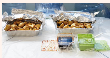
Delicious samosas with chutney from India