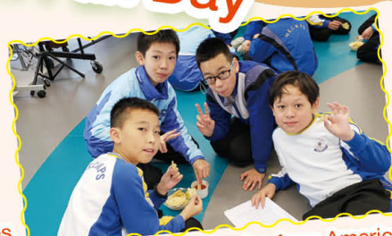
Enjoying chips and salsa from America