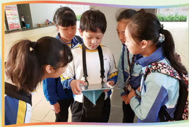
Can you guess the picture?