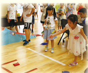
Come and join the fun!