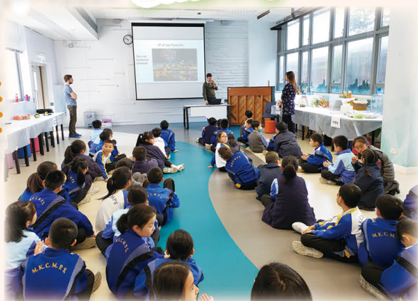
NETs sharing their culture with Elite Team students