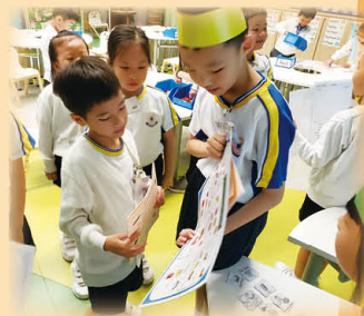
Ordering food in MKC Restaurant