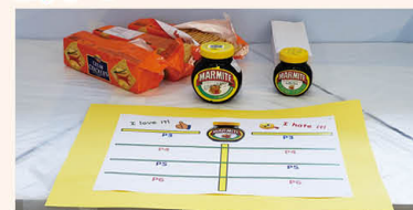
Crackers with Marmite from the United Kingdom