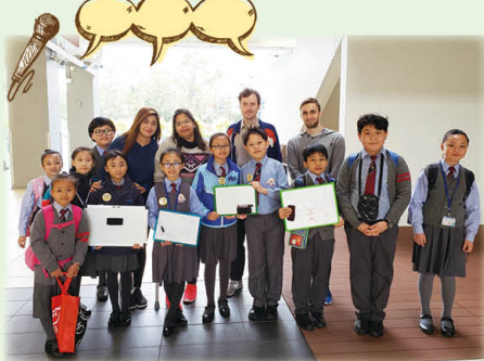
Meet our Chat Captains

Every morning there's a different chance to chat with the NETs or have an assembly. Chat Captains are student helpers recruited to chat and play games with students on Wednesday mornings. Other mornings the NETs hold assemblies and chat when students arrive. At Choi Yuen, the NETs even join in morning exercises.