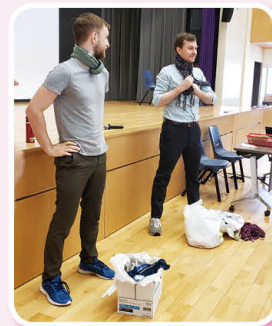
Is it chilly in here?