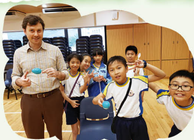
Egg and spoon race