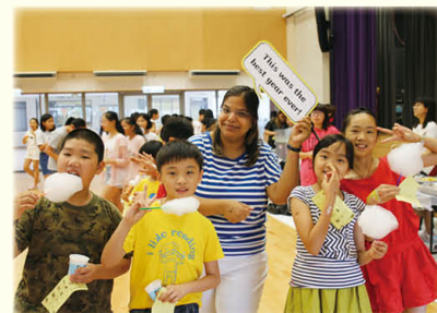
Students posing with Miss M