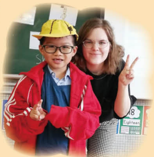
Strike a pose with Miss T!