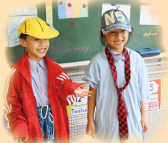
P.1 students are all smiles.