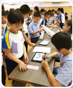
English Day iPad games