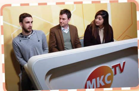
NETs in the studio chatting about their favourite animals

MKC NET TV is our school English language video channel. Our NETs have made all kinds of English videos ranging from humorous to informative ones. Students enjoy watching the videos at lunch. Take a look at what happens behind the scenes.