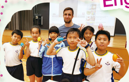
Opening eggs at the Easter party