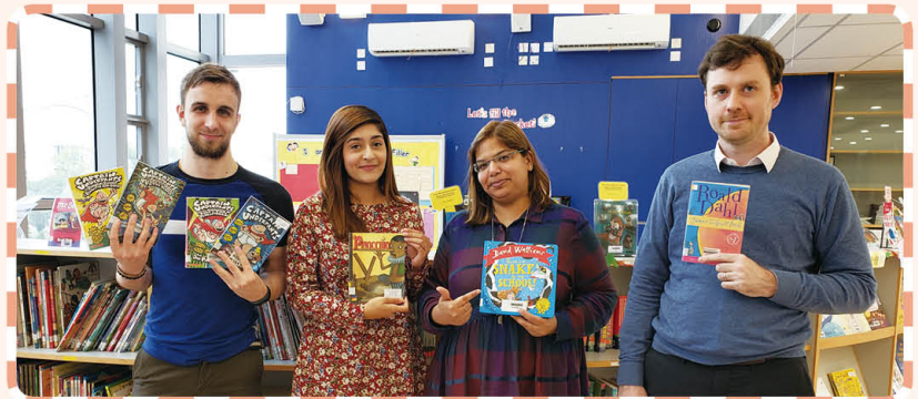
NETs recommend books to read