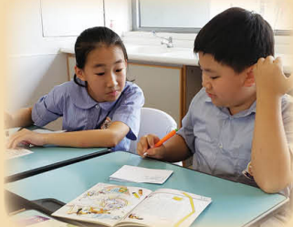
Students sharing their diary entries