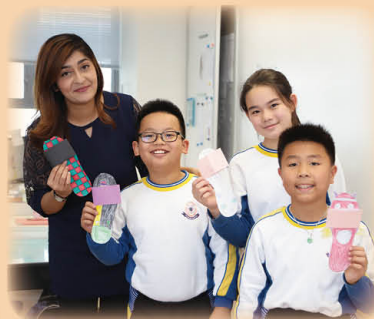
Making shoes after reading Elves and the Shoemaker

Students read about helping others and keeping fit.