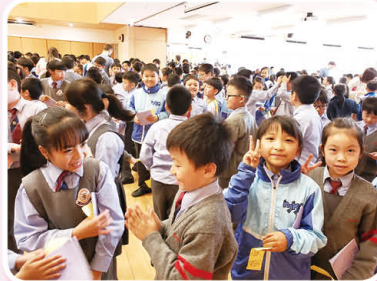
Friday recess games are the place to be!