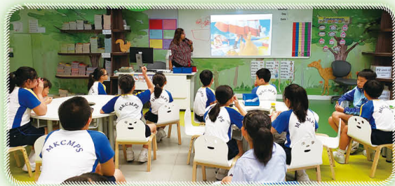
Miss M reading a story

Storytelling is a great way to arouse students' interests in reading English books. Introducing books from the library motivates students to check out new titles.