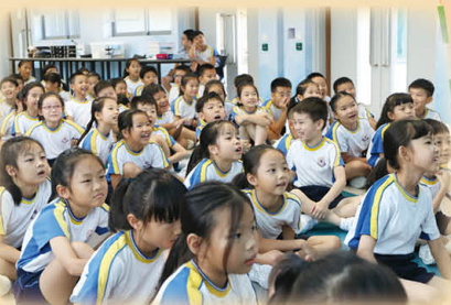
P.3 students in the end-of-year sharing programme