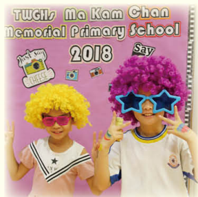
Take photos and be a star!