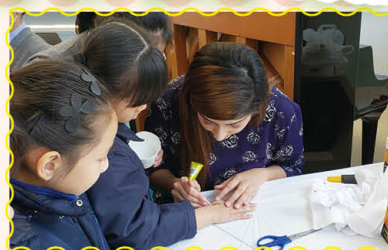
Students getting Pakistani henna tattoos