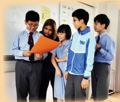
Presenting animal adoption posters