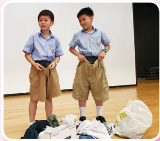
Assembly games: Learning about clothes

English Days happen every Friday and feature a number of different themes. This term students learned about clothes, animals and food. It's a great opportunity to chat with friends, play games and practise English.