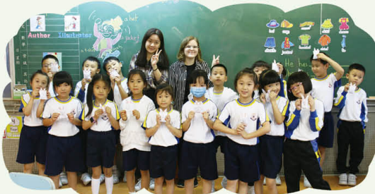
Happy Easter from Elite Team!